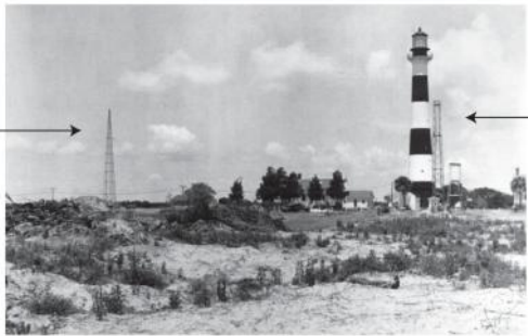
The original 1931 radio tower can be seen at far left. A new 1950 radio tower is under construction just to the right of Lighthouse.

Transmissions were coordinated with the radio beacons at St. Johns River and Jupiter Inlet Lighthouse, providing ships with a cross bearing in order to help fix their positions. The signal could be received from 50 to 150 miles out to sea. A modern differential GPS beacon replaced the radio beacon in 1996.