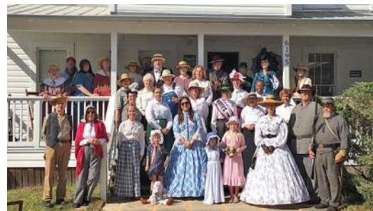
Sams House Reenactment Actors