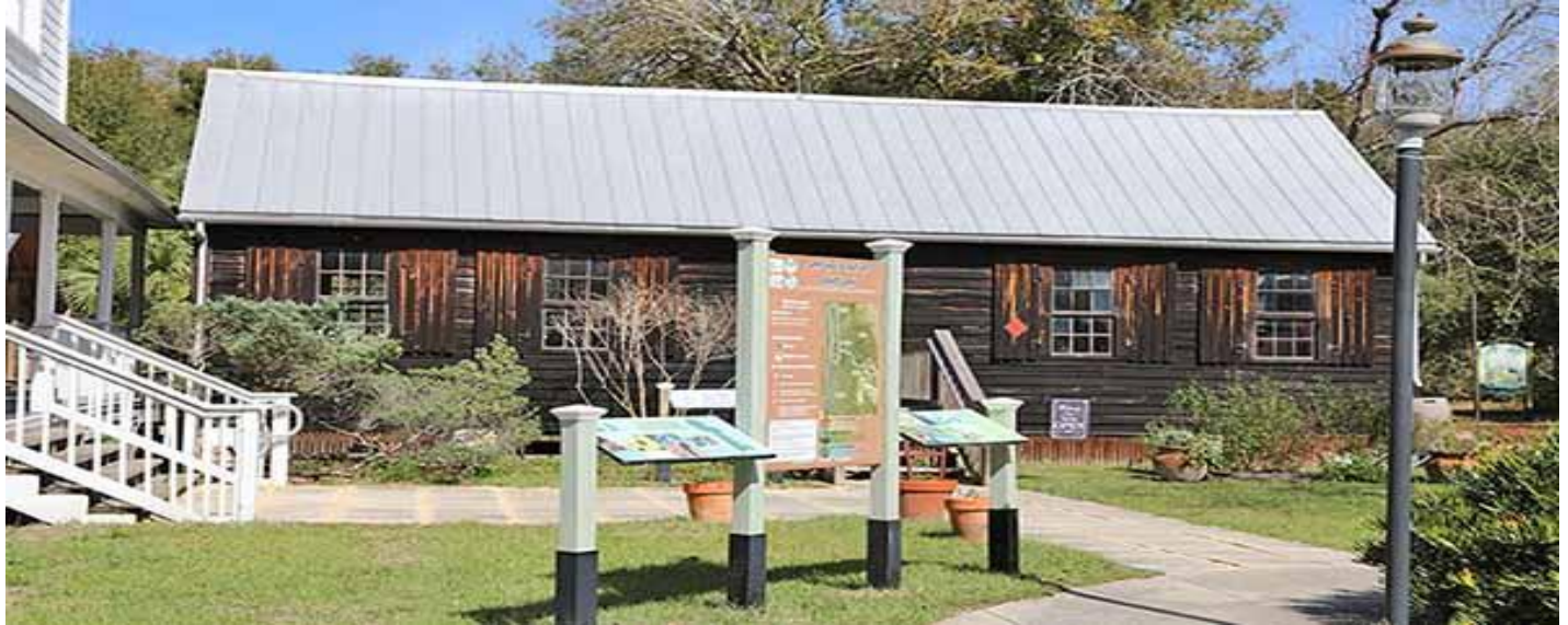
The Original Sams House Cabin

The oldest standing historic home in Brevard County (other than the lighthouse) is Sams House at Pine Island (Merritt Island), also a member of the Museums of Brevard. Open Tuesday through Sunday, 9:00 AM to 5:00 PM. Admission is free. Park Location: 6195 N. Tropical Trail, Merritt Island, FL 32953.