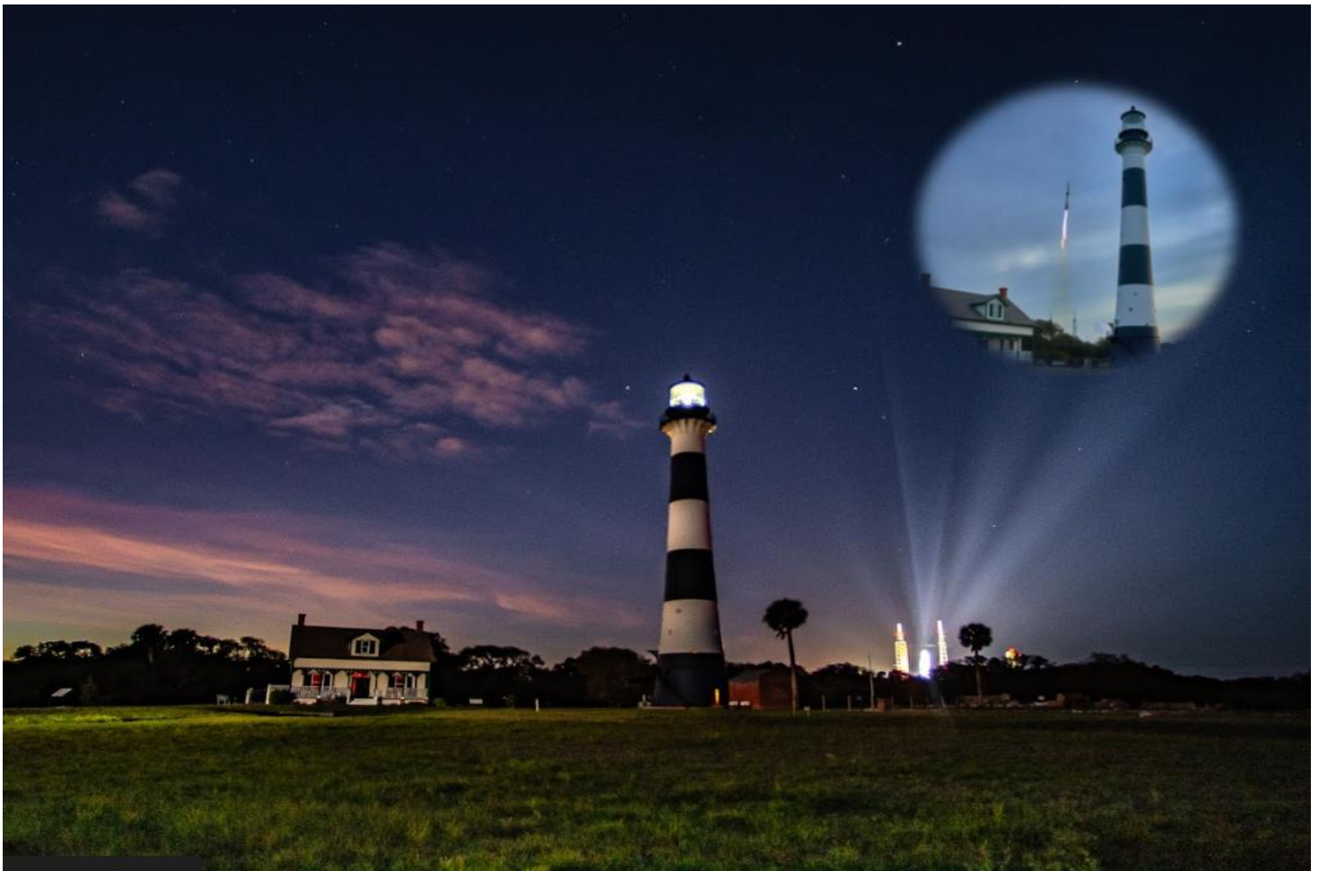
Insert photo of New Glenn 31- AST Bluebird 7 launch on 19 April 2026