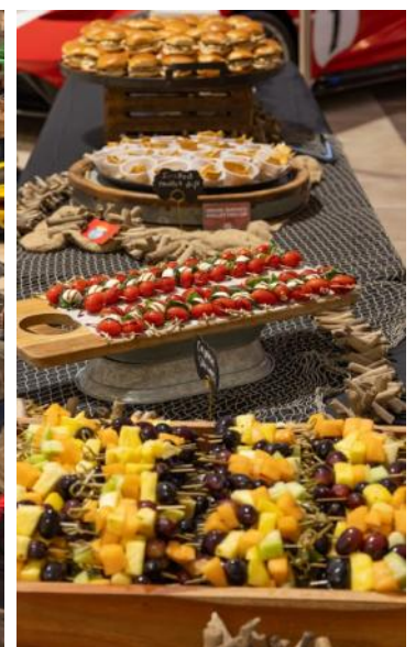
Wild Ocean Market– Delicious hors d'oeuvres