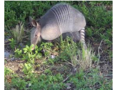
Not all residents were in awe.