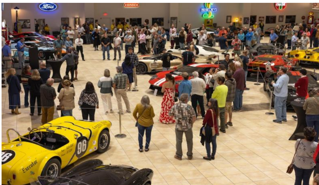
Action at the Auction