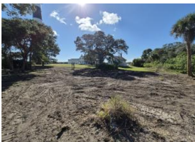
The oak trees were saved.

At last, what was once WILL be again! The site clearing has begun for the construction of the two new cottages!