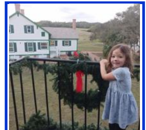
28 DEC 2024 Lighthouse Membership Convoy Event