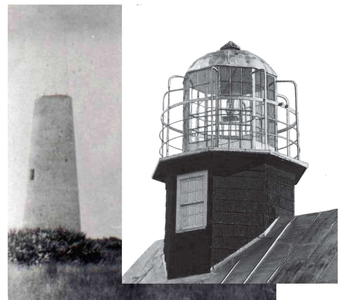
1848 brick tower and example of a birdcage-style lamproom similar to the one originally on the top.