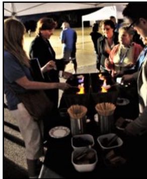
The SMORES station was a huge hit, enjoyed by young and old alike!