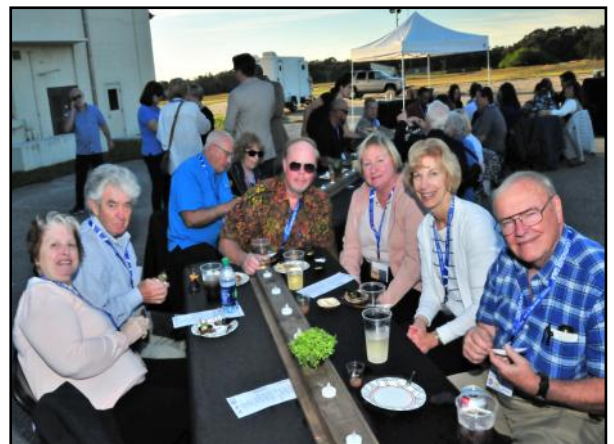
New CCLF members catch up on the latest gossip at the lighthouse while enjoying appetizers and cocktails during the Fundraising Gala.