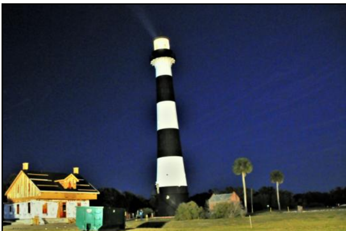
And with historic precision, our star attraction, the Cape Canaveral Lighthouse, illuminated the night!