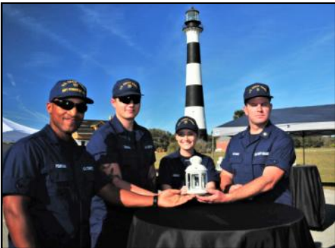
Thanks to our local heroes from U.S. Coast Guard Aids to Navigation Team Ponce for helping us throughout the event!

https://drive.google.com/drive/folders/18SGZxRLELgmCN2-aFquMrYLDOWTWm1iC