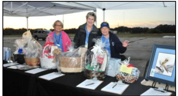
As always, our tireless volunteers are ready, willing and able to help our cause - in this case, making sure our silent auction was a huge success!