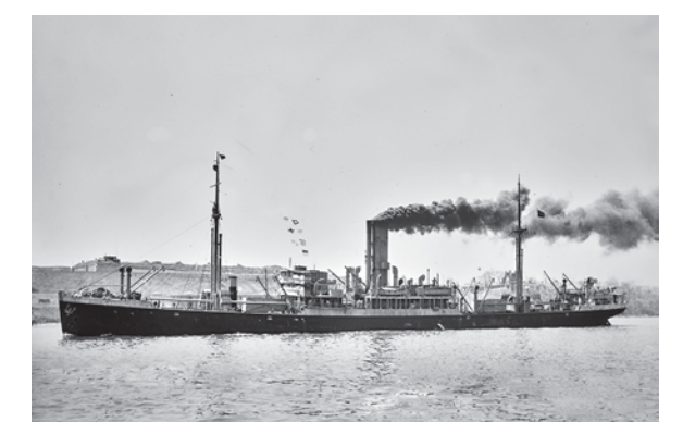
LAERTES Dutch Merchant Ship May 3, 1942

Many ships were attacked off Cape Canaveral from February through May 1942, with the 6 above being sunk, leaving 70 dead and 189 survivors from 4 different nations. Along with all coastal residents throughout the US, Cape Canaveral residents also turned off their outside lights and put blackout curtains on their windows so ships at sea or airplanes overhead could not see them and attack.