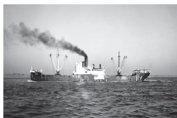
LESLIE American Merchant Ship April 13, 1942