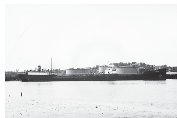
PAN MASSACHUSETTS Steam Tanker February 19, 1942