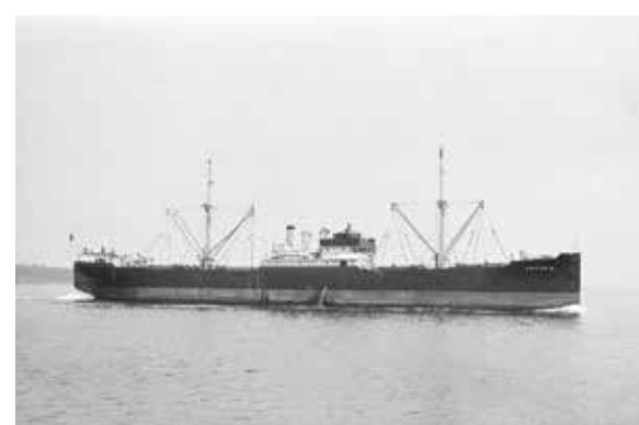
KORSHOLM Swedish Merchant Ship April 13, 1942