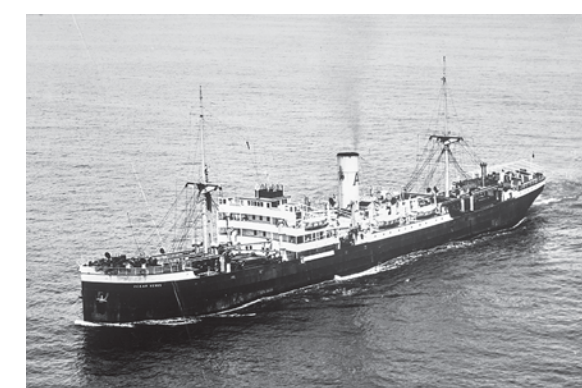
OCEAN VENUS British Merchant Ship May 3, 1942