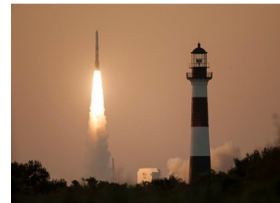
Cape Canaveral Lighthouse Cape Canaveral Air Force Station, FL