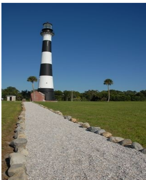
Shell & Stone Walkway