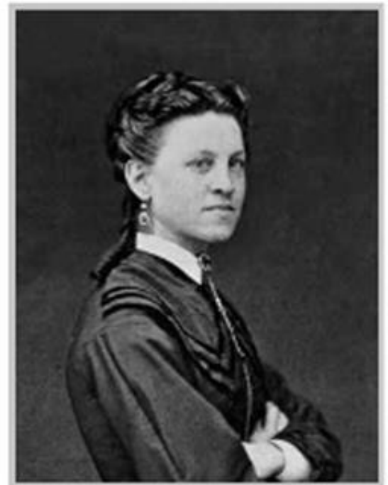
Ida Lewis Lime Rock Light, RI 1857 - 1911

Next up with our Women Keepers is Ida Lewis, who served as keeper of the Lime Rock Light in Rhode Island from 1857 to 1911. Ida was the most famous lighthouse keeper of her time, male or female. She took over from her disabled father at the age of 15. She was also an expert rower. Her lighthouse was along exceptionally treacherous waters, and she is credited with saving at least 18 lives by rowing her boat out to rescue foundering sailors in all types of storms. She received the Congressional gold medal and the highest award of the US Life Saving Service. She was on the cover of many magazines and newspapers in her era, with several famous paintings done of her rescues. In 1924, the Lighthouse Service changed the name of the light to Ida Lewis Rock Light Station. This is the only time in US history any such honor was ever paid to a keeper.